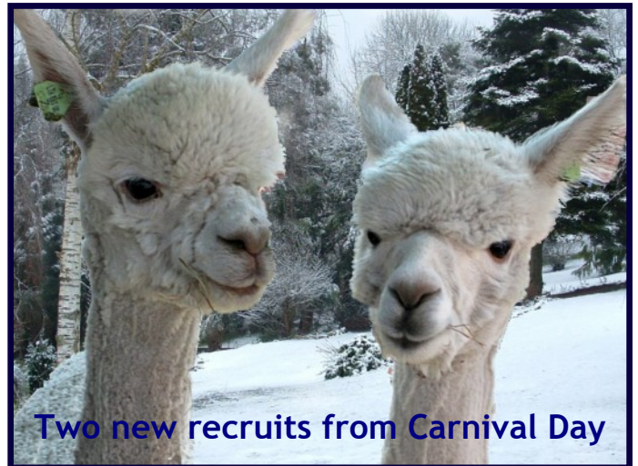
Two new recruits from Carnival Day