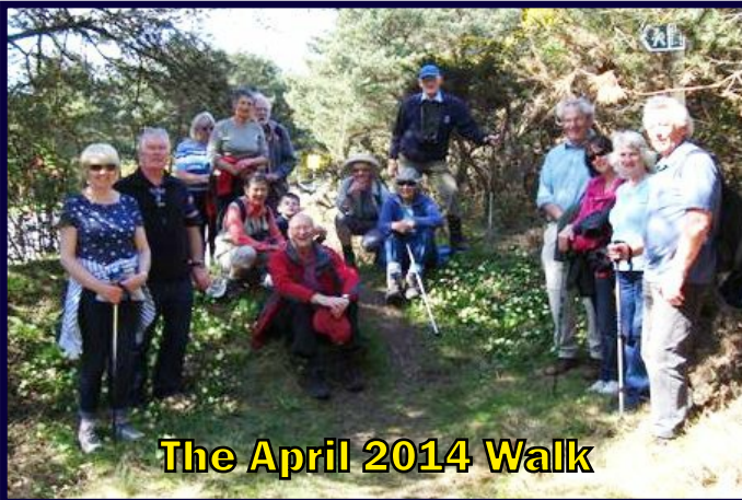
The April 2014 Walk