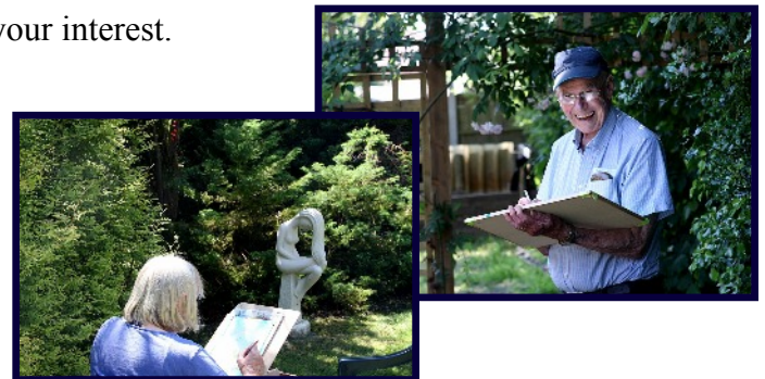
The Painting group visits some members' gardens in the Summer months