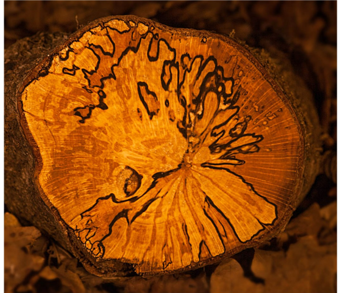
Pattern in trunk section CB

If you are interested in taking your photography to the next level come and join us. We welcome both experienced and novice photographers.