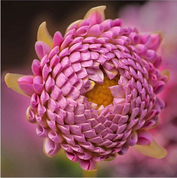
Opening flower CB