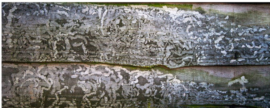
Marks on fence panel CB