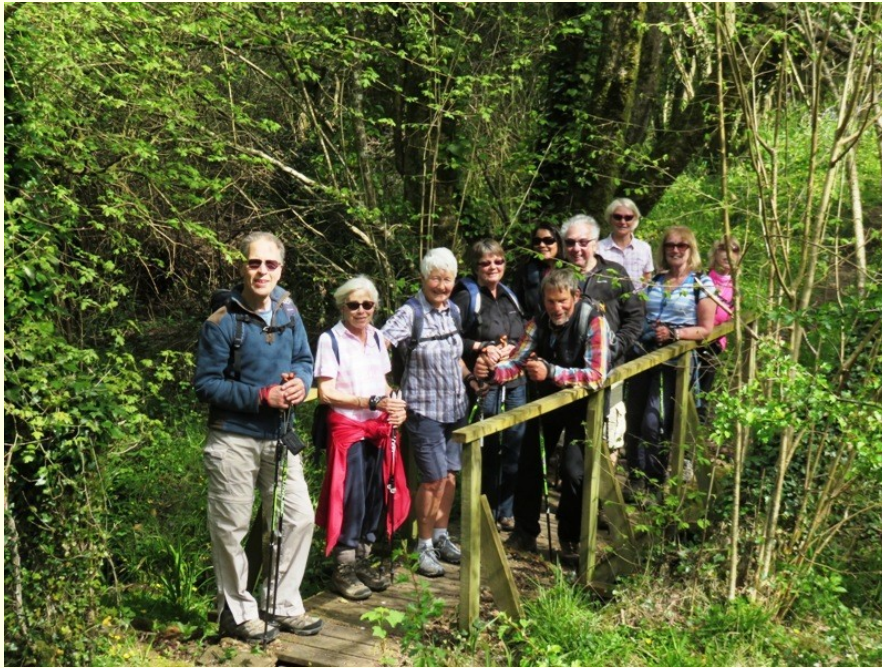
A summer walk in Wilkswood, Langton Matravers