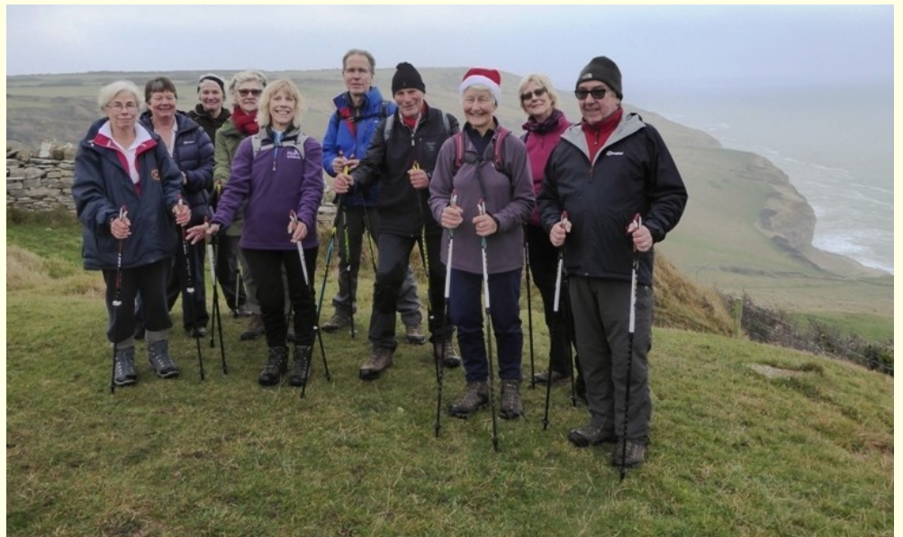
Our Christmas walk on the Jurassic Coast

A warm and supportive welcome awaits new members.