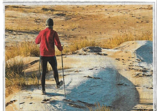
A walker sets out on the English Coast Path from Seaton Carew beach, Co Durham